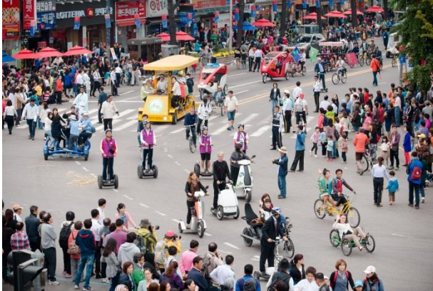
EcoMobility Ride during the EcoMobility World Festival 2013

The EcoMobility World Festival (EMWF) concept was initiated by ICLEI - Local Governments for Sustainability.