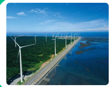
Offshore Wind power Park