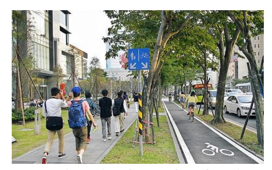
Separating Bicycles and Pedestrians